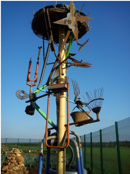
Junk sculpture constructed by volunteers and Phil Neal, sculptor, as tribute to the old allotmenters of Langwith

Volunteers work on the farm and in the office or café, building their skills and confidence towards future employment and health. Good support levels enable more people to become productive members of the community.