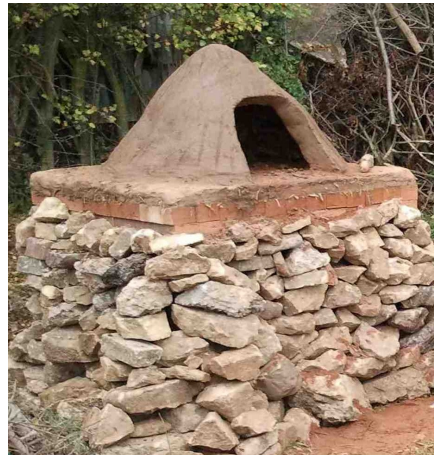
The outdoor pizza oven, constructed by volunteers