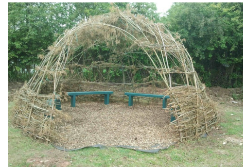
Willow dome built by volunteers and Job Centre workers