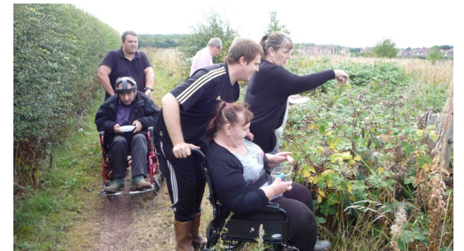
Volunteers picking blackberries